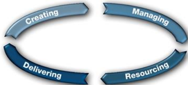
Figure 1: Cyclical pattern of Process Stages

These stages interact with one another in a cyclical pattern as shown in the diagram below. Of course, the work of a team may go through several cycles to achieve a particular goal or task or to deliver a project.